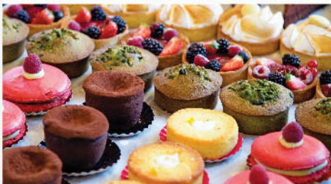
BAKERY & CONFECTIONERY