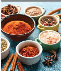
SPICES & CONDIMENTS