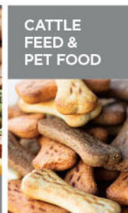
CATTLE FEED & PET FOOD