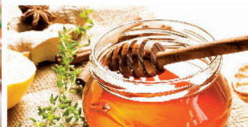
HONEY & HONEY PRODUCTS