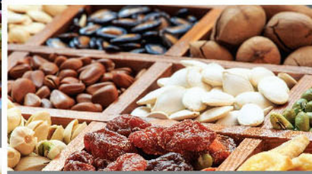
NUT, NUT PRODUCTS & RAISINS