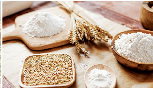
WHEAT & WHEAT PRODUCTS