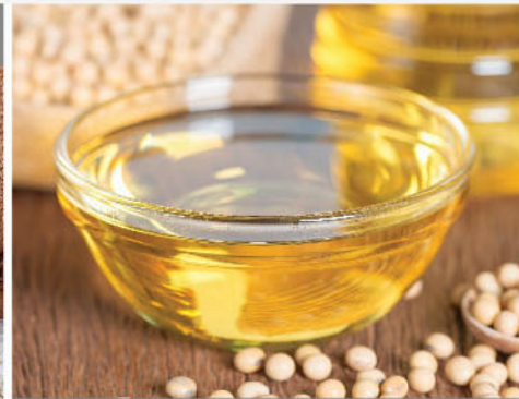
OIL & OIL SEEDS