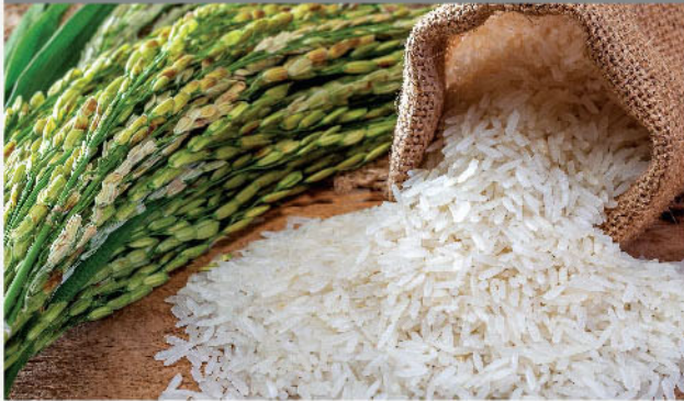
CEREAL & CEREAL PRODUCTS (PADDY & RICE)